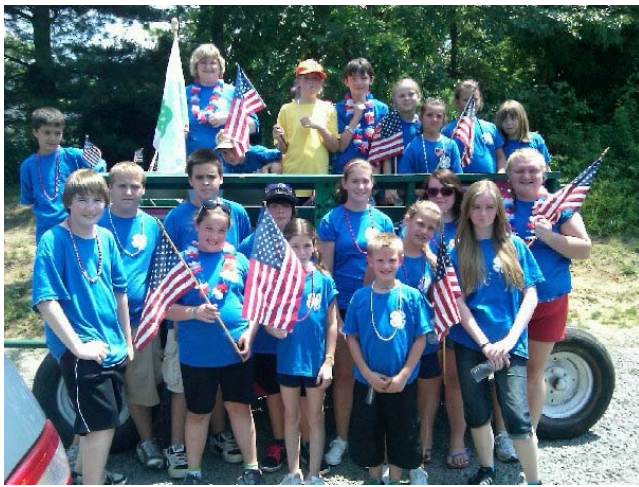
Barnyard Bandits members marched in the Memorial Day parade on May 31, 2010, in New Egypt.