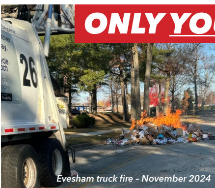
Evesham truck fire - November 2024

Recycle these at Home Depot, Lowes, Staples and other locations listed at www.Call2Recycle.org .