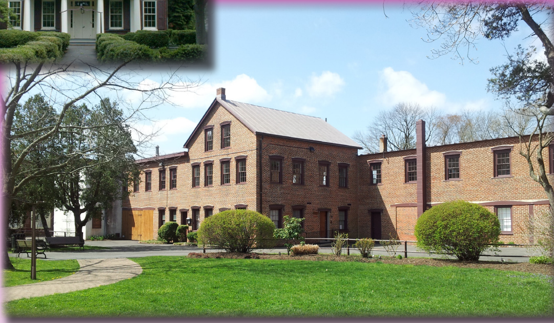
Smithville Mansion Annex Gallery