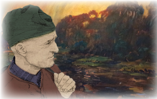
PAINTER • AUTHOR • PHILOSOPHER 1905-1997