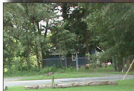
Creek Community by Hugh H. Campbell & photo as it looks today.