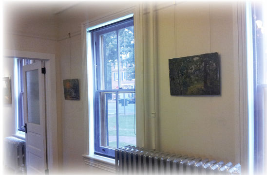
EXHIBIT SPACE AVAILABLE